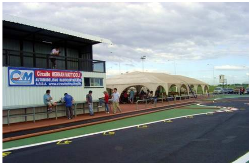
Pit line and paddock