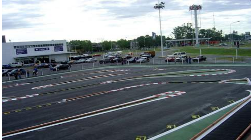
View from the stand