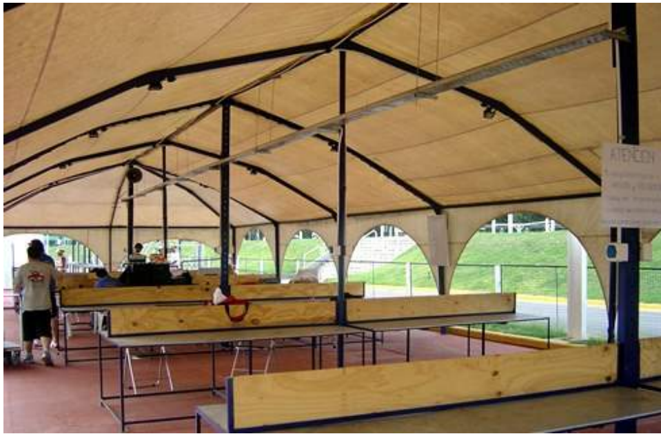
Pit area with tables and electricity